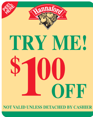
FRONT OF LABEL

- NOT FOR EXACT COLOR MATCH FOR PLACEMENT ONLY -