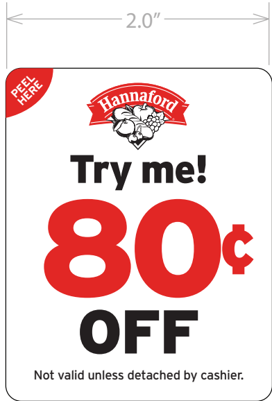
FRONT OF LABEL