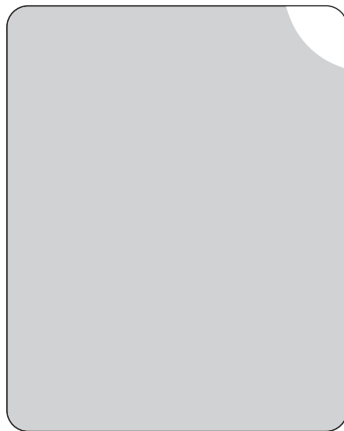
ADHESIVE ON BACK